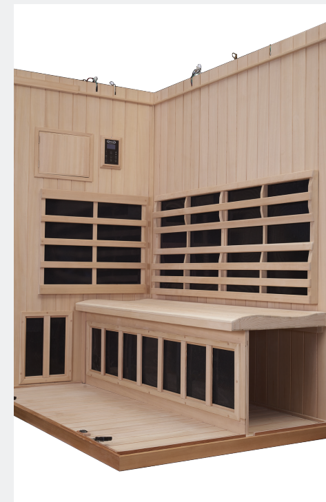
Actual Assembly - Clearlight Sanctuary 3

For more information: infraredsauna.com (800) 798-1779